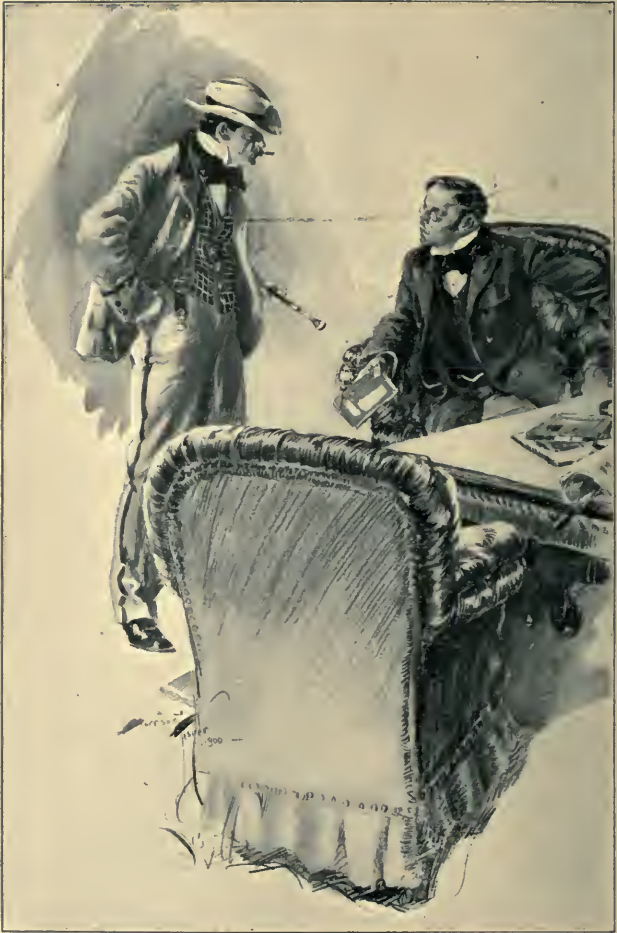
“I—I AM NOT EXACTLY A GUEST, HE STAMMERED.”—Page 4